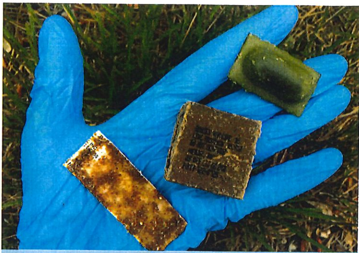
(top right to bottom left) ONRAB blister pack, RABORAL V-RG® fishmeal polymer, RABORAL V-RG® coated sachet